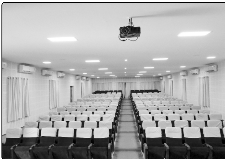
Sirivaram Adinarayana Rao Auditorium