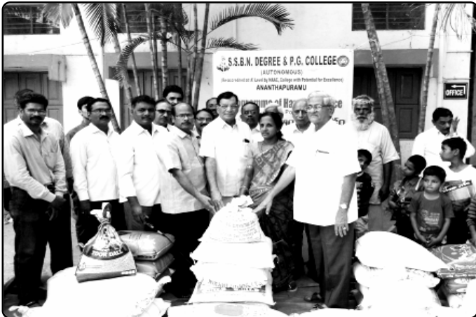
Social Responsibility : Management, Principal and Staff donating Dal and Rice to the orphanages under 'Handfull of Rice' Programme on 27-2-2017