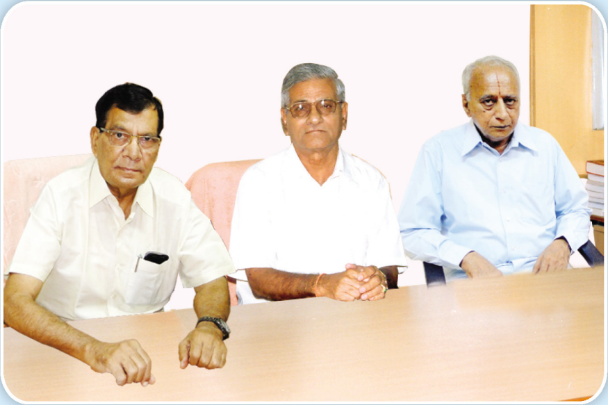
PRESIDENT, CORRESPONDENT & SECRETARY