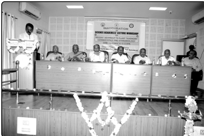
Joint Science Education Panel Sponsored Lecture Workshop on Recent Advances in Plant Taxonomy, Conservation and Ethnobiology on 14th & 15th December 2016 Organised by Dept. of Botany