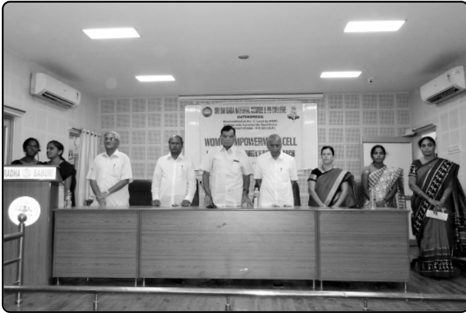
Women Empowerment Cell (WEC) celebrating International Women's Day on 8-3-2017