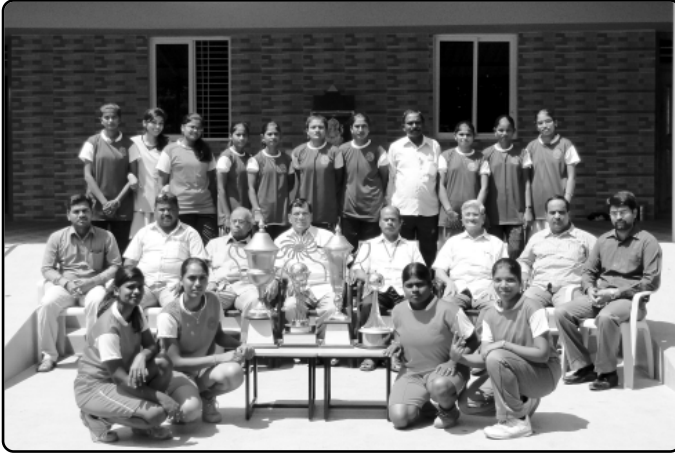
Women Games Championship Cups, at SKU Inter Collegiate Tournaments, held at Hindupur from 30-9-2016 to 2-10-2016