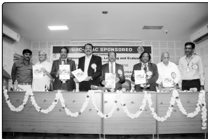
UGC - NAAC Sponsored National Conference on "ICT Empowered Teaching, Learning and Evaluation" organised by IQAC on 16-17, December 2016